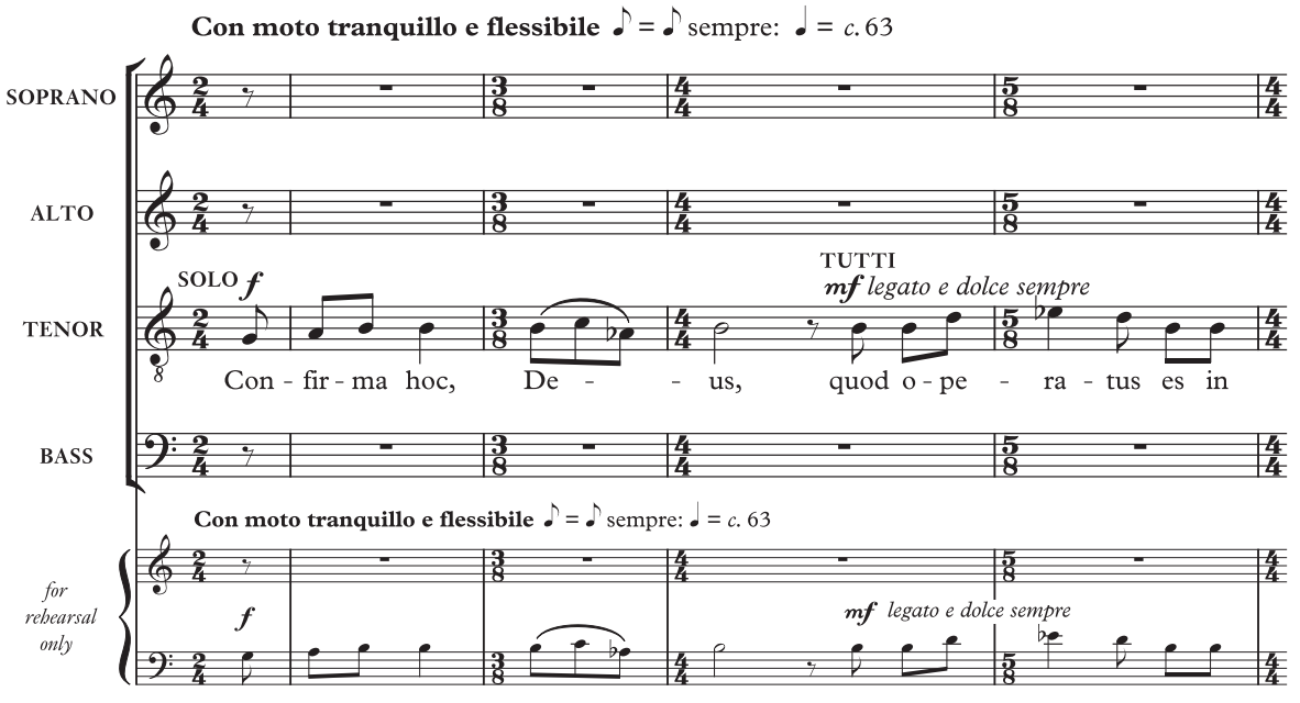
Establish, O Lord, what you have wrought in us.