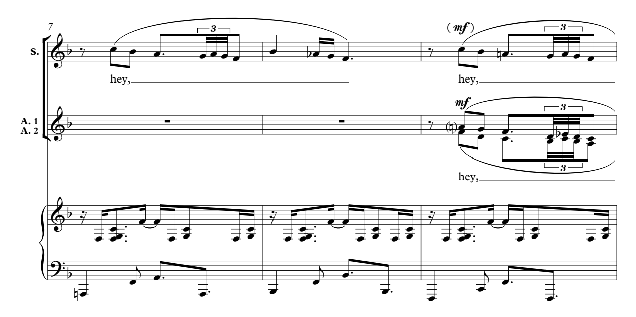
The Look was commissioned by the Cantiamo Girls Choir of Ottawa and first performed on 8 June 2013.