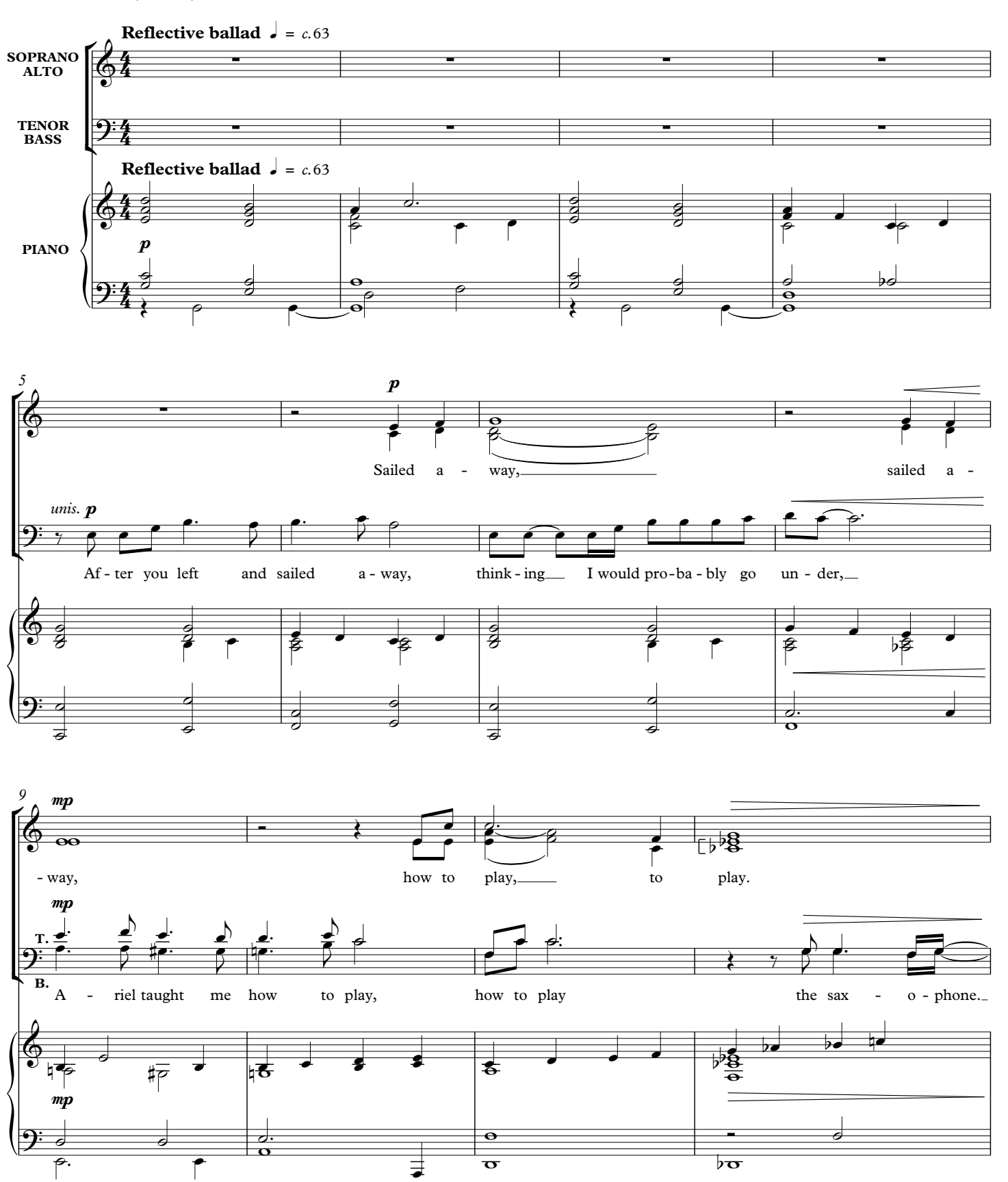
Music © Oxford University Press 2015. Text © Charles Bennett. Reproduced by permission of the author. Photocopying this copyright material is ILLEGAL.